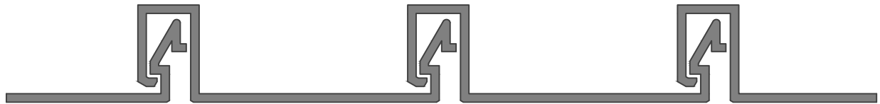
16" SNAP-LOCK PANEL (STRETCH FACTOR: 1.20)