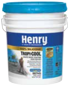
100% Silicone Technology

Henry® produces quality products and systems, designed to provide you with a solution for most roof maintenance projects – from simple repairs, to recoating to restoration.