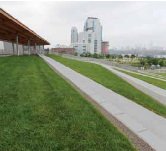
Green Roof, Brooklyn, NY