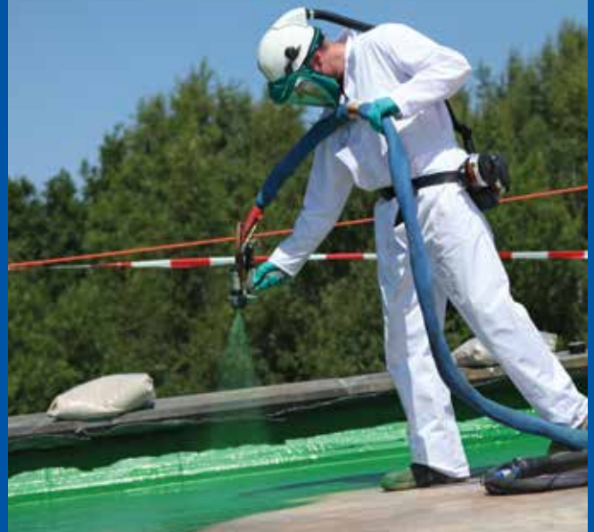
Installation of Prodeq FX400 membrane

This unique installation service is our commitment to maintaining the highest possible standards in liquid applied waterproofing.