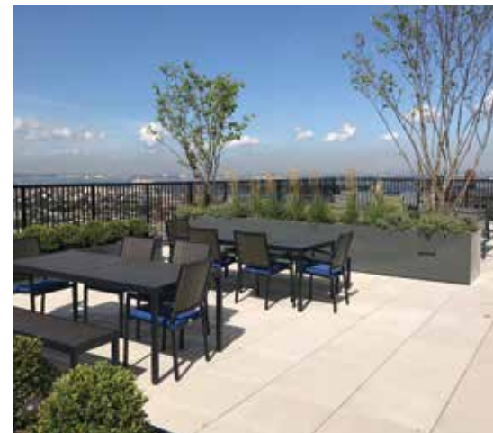
Rooftop, Brooklyn, NY