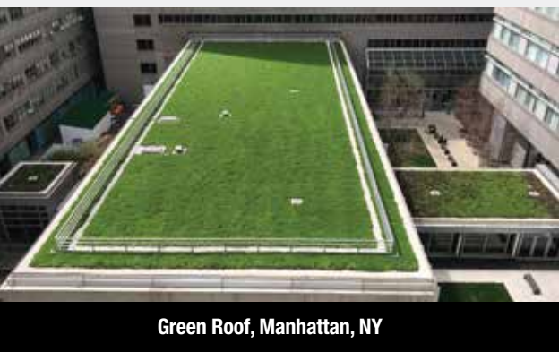
Green Roof, Manhattan, NY

With a proven track record in North America since 2000, the Henry Prodeq System provides superior waterproofing protection for plaza decks, green roofs, split slabs and terraces. Contact a Henry Representative today to see how a Prodeq System can help you build with confidence on your next project.