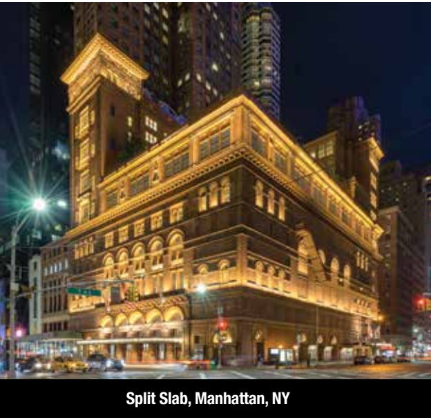
Split Slab, Manhattan, NY