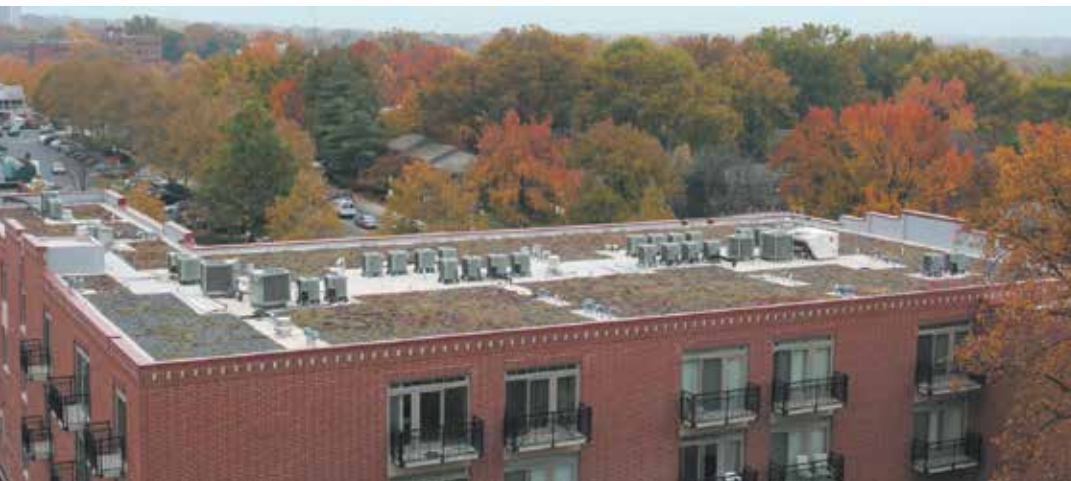
Green Roof, Falls Church, VA