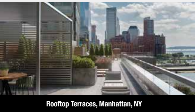
Rooftop Terraces, Manhattan, NY